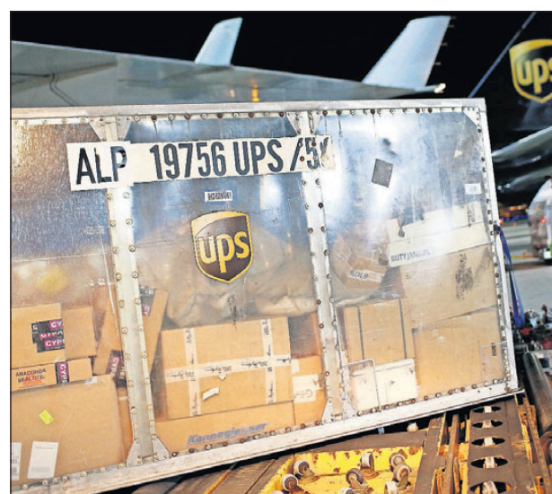
A UPS airplane is unloaded at the company's Worldport hub in Louisville, Ky in 2015. UPS has struggled this year to keep pace with the delivery demands of the holiday season.

UPS's vast ground network delivered 91.5 percent of its packages on time during the week through Dec. 9, ShipMatrix reported Wednesday. The Atlanta-based courier posted a 94.4 percent on-time rate the previous week. FedEx completed 97.1