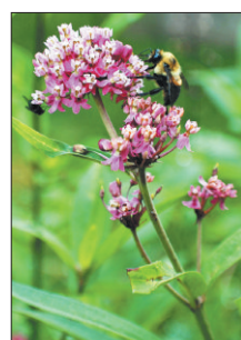
A carpenter bee on milkweed.