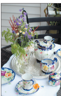
Set for a lovely garden tea in the Pavlica garden.