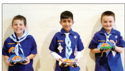
Best of the Bears hold their winning cars.

Playwick District serves youth in the communities served by the Morrisville, Pennsbury, Neshaminy and Council Rock school districts.