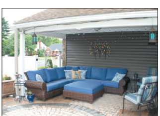
A relaxing outdoor living space on the Yurchak patio leads into an expansive garden area.

TimberRock Landscaping LLC installed a temporary fountain that served as a focal point for the Garden Marketplace on the lawn of the Burgess Foulke house.