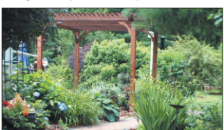
A pergola in the Newett garden.