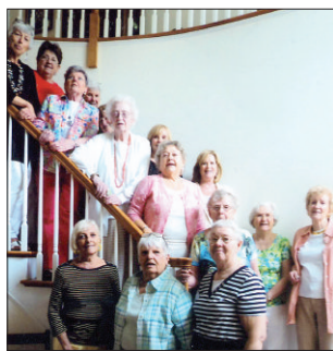
Kings Path Questers.

broader community to raise the remainder to restore the remaining four gate posts,” said Bergere. “We are all volunteers in this effort, so none of the money goes to “overhead” – every dollar will be committed to gate restoration,” said Bergere.