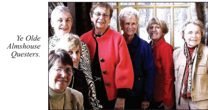
Ye Olde Almshouse Questers.